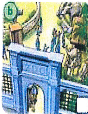
monkey / snake