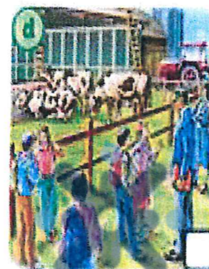
cows / a walk